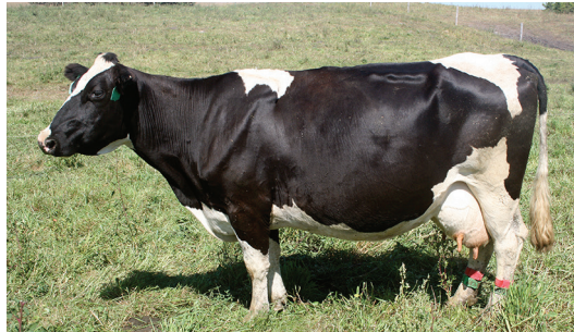
Holstein cow (born 2010) from the 1960 control line.