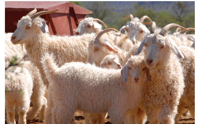
Angora goat numbers have greatly declined. Texas Angora producers generously provided access to goats for collecting embryos and semen for the collection