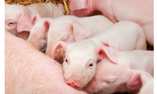
A university used semen from the collection to totally regenerate a line of pigs to study a human disease.